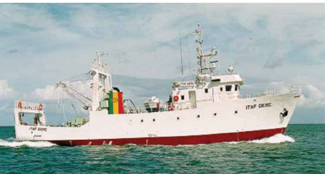
Figure 2. The Senegalese research vessel RV Itaf Deme.