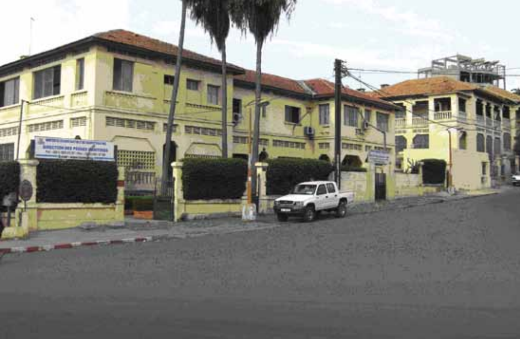
Figure 4. Direction des Pêches Maritimes.

The beneficiaries of these products and services are: scientists, students, NGO's, government, private sector. Further information can be found on the website: