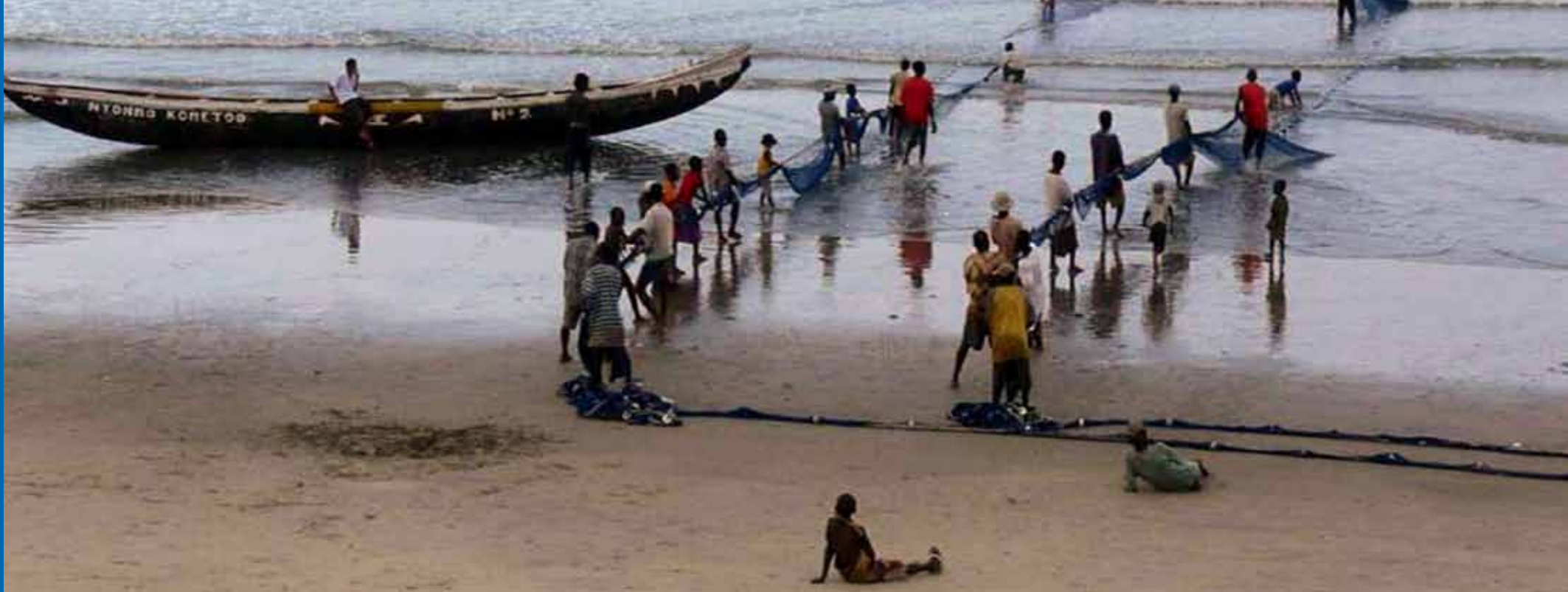
Figure 3. Fishing along the beach at Thiaroye near Dakar.