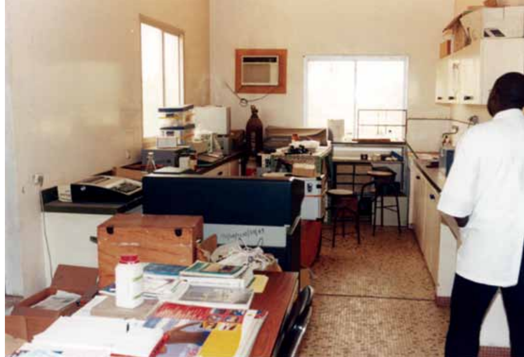
Figure 5. A laboratory at CRODT, Dakar, Senegal.